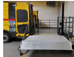
The Loading Dock