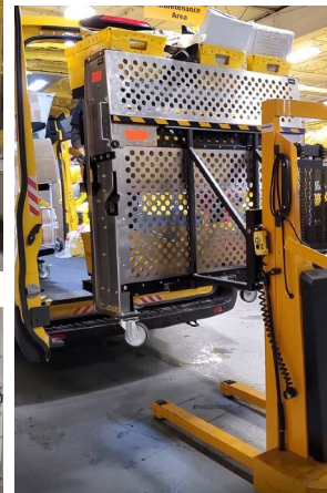
The Lift Truck